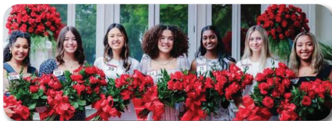
Tournament of Roses® 2022 Queen and Court