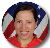
Eleni Kounalakis California Lieutenant Governor